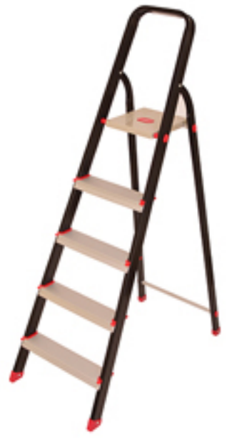
Aluminium Step Ladders with/without Tool Tray